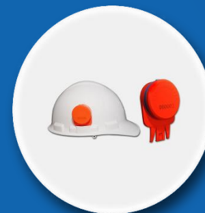
Helmet Sensor with Man-down and SOS button (BLE)