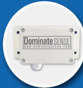
Mini Wi-Fi IoT Gateway (BLE)