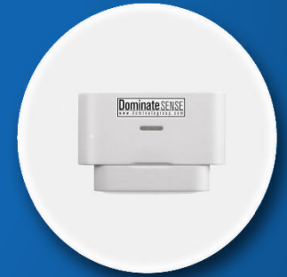
Contact Sensor (LoRa)