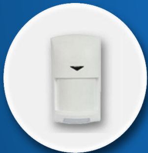
IR Motion Sensor (BLE) Temperature/Humidity Sensor (LoRa)