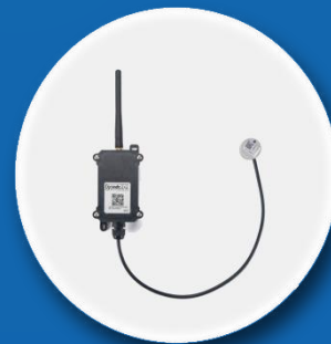
Liquid Level Sensor (LoRa)