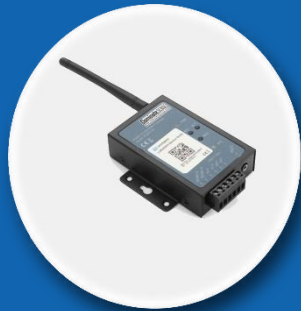
RS-485 (Modbus) to LoRa WAN converter