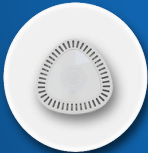
Smoke Sensor (BLE)