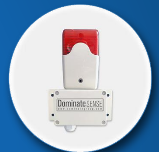
Wireless Site Emergency Event Notification (BLE)