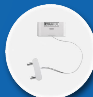
Water Leak Sensor (LoRa)