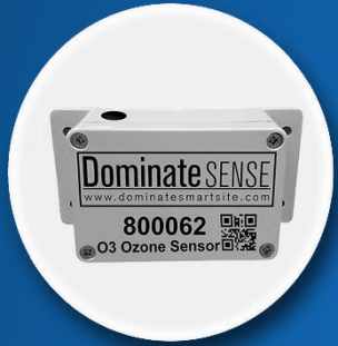
O3 (Ozone) Sensor (BLE)