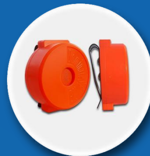
Belt Sensor with Man-down and SOS button (BLE)