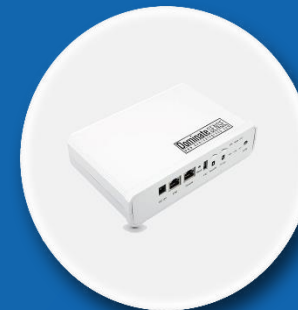
Mini IoT Gateway (LoRa)