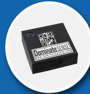
Combo Sensor (BLE) (Temp/Humidity, light, air quality)