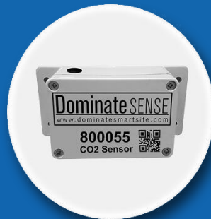
CO2 (Carbone Dioxide) Gas Sensor (BLE)