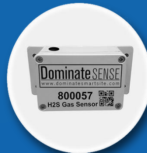
H2S (Hydrogen Sulfide) Gas Sensor (BLE)