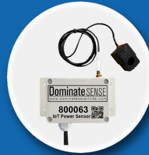
Power Sensor (voltage & current) (BLE)