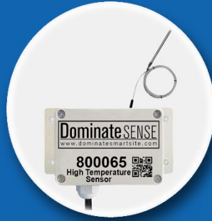
High Temperature Sensor (850F) (BLE)