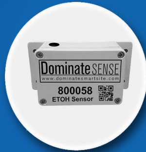
ETOH (Ethanol) Gas Sensor (BLE)