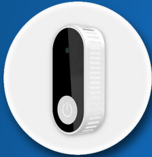
Temperature/Humidity Sensor (BLE)