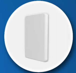
Slim Tag (BLE)