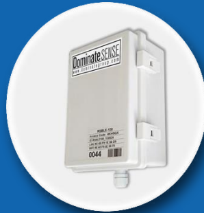
IoT Gateway (BLE)