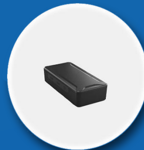
GPS Container Tag