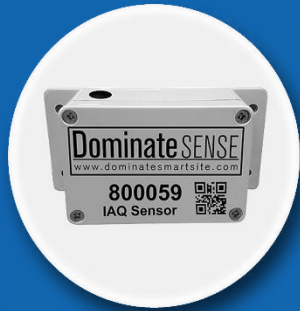
IAQ (Indoor Air Quality) Sensor (BLE)