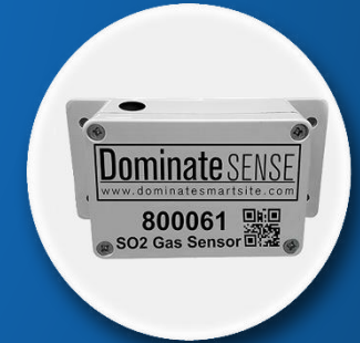
SO2 (Sulfur Dioxide) Gas Sensor (BLE)