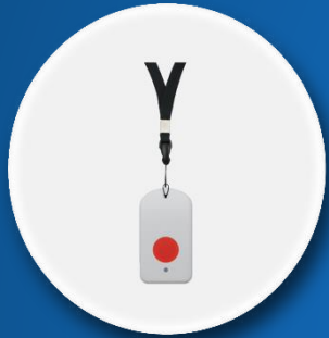
Personnel Tag (GPS & Motion) (LoRa)