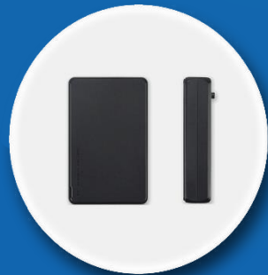
GPS Vehicle Tag