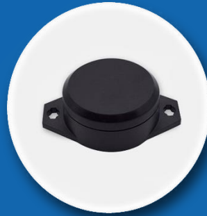
Vibration & Motion Sensor (BLE)