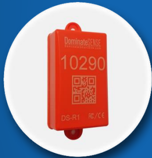
Location Router (BLE)