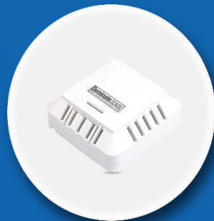
Environment Sensor (Temp/humidity, air quality & pressure) (LoRa)