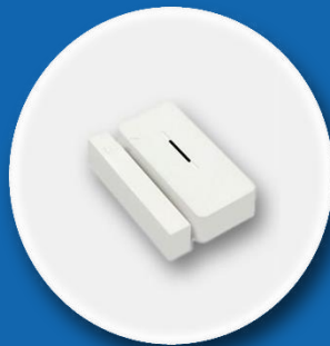
Magnetic Contact (BLE)