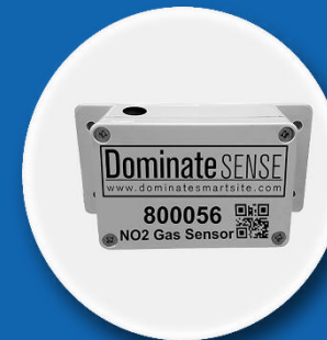
NO2 (Nitrogen Dioxide) Gas Sensor (BLE)