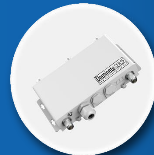
IoT Gateway (LoRa)