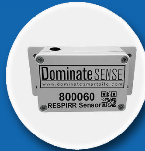
RESPIRR (Respiratory Irritant, Air Quality) Sensor (BLE)