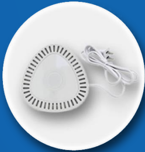
Methane Detector Sensor (BLE)