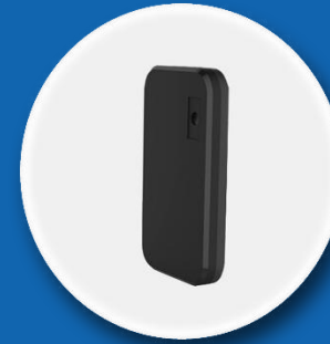
Light Sensor (BLE)